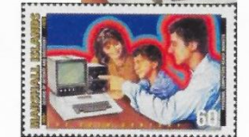
The stamp right has a connection to Steve and Apple. Notice the early Apple logo on the screen, the disk drive and on the keyboard (enlarged). Acknowledgements: Grand Lodge of British Columbia, Wikipedia, Who2 Biographies